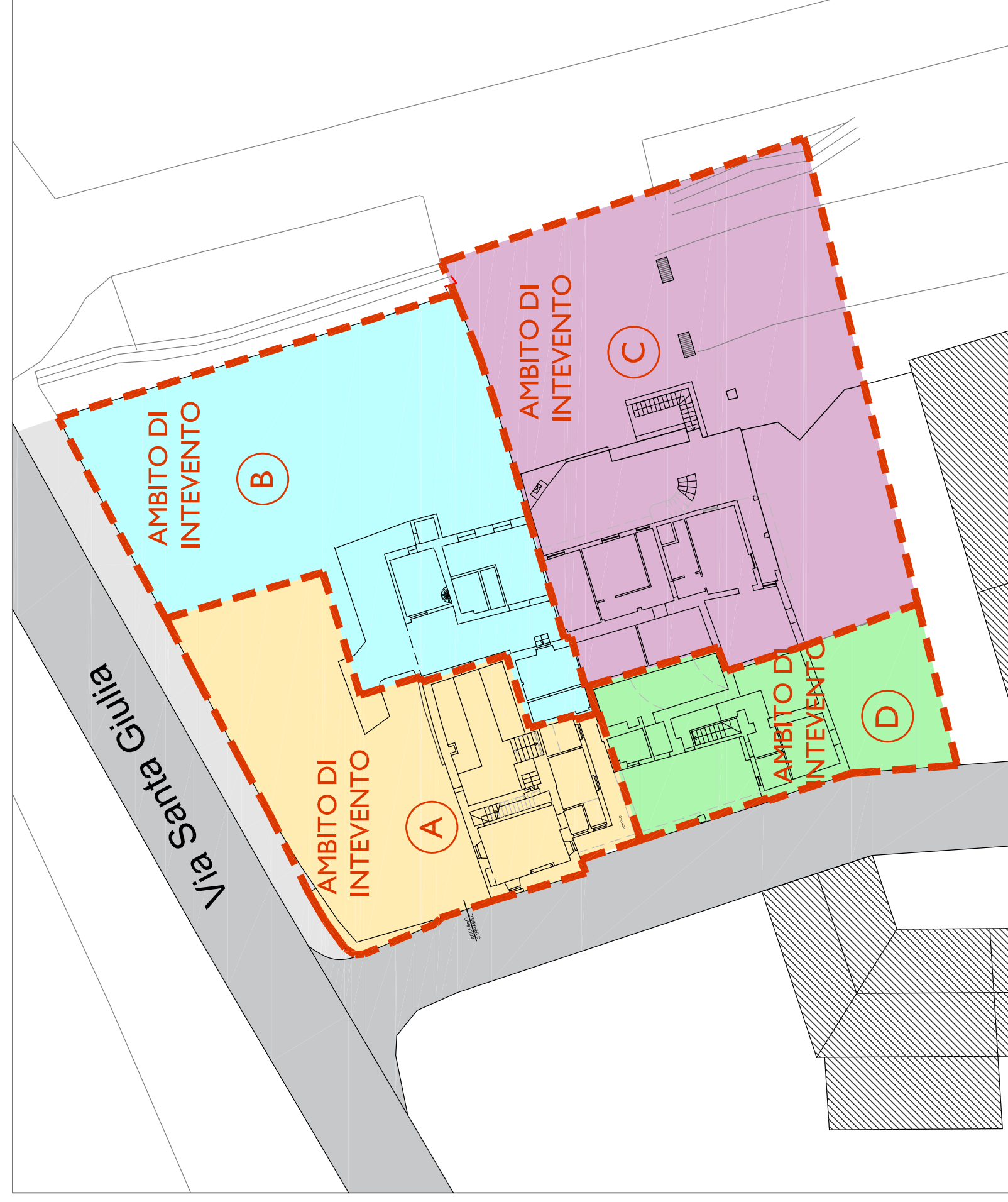
PIANTA PIANO PRIMO - STATO DI COMPARATIVO